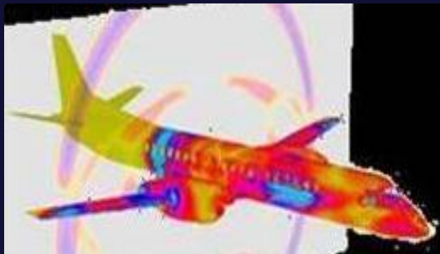
Modeling, Simulation, and Effects