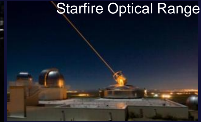
Starfire Optical Range