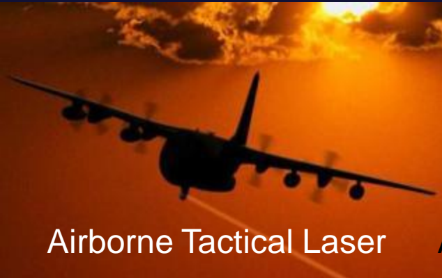
Airborne Tactical Laser