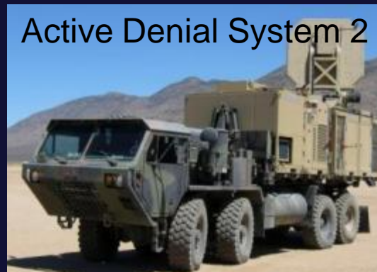
Active Denial System 2