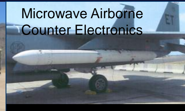
Microwave Airborne Counter Electronics